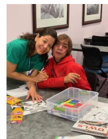
Cook Children's Hospital Ed Day