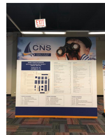
CNS Conference in Chicago