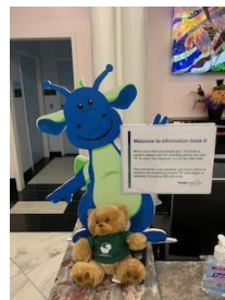
Webster at Cook Children's Hospital