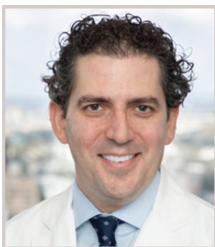
REUNION OF CHAMPIONS HONOREE

CELEBRATING RARE BRILLIANCE & THE POWER OF RESILIENCE