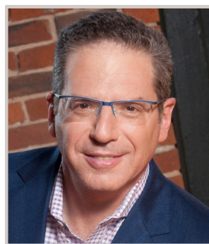
LEGACY LEADER HONOREE